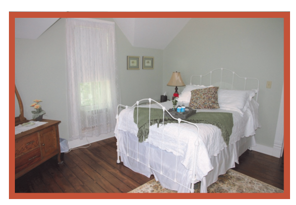
Cather's bedroom, now called "Frankfort" after the fictional village in Cather's Pulitzer Prize-winning novel, One of Ours .

residence in Cather's touching late story, "The Best Years."