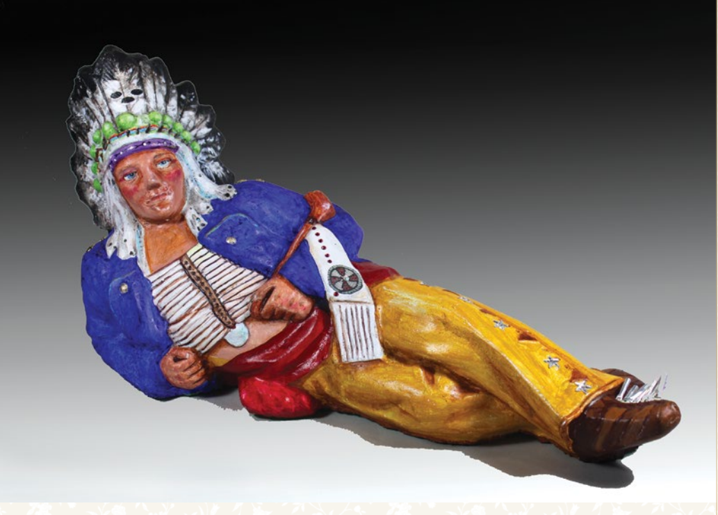
Juanita Pahdopony, Kitsch Me, I'm Indian! 2016; cast concrete, acrylic, aluminum cones, buckskin, rhinestones, paper, 9 \times 27 \times 8 inches; Courtesy of the artist.

The public is invited to attend a reception celebrating the exhibit's opening on Saturday, April 13, at 6:00 p.m. The reception will be preceded by a reading and book signing by author Walter Echo-Hawk and followed by a theater, music, and storytelling production by Native American folklore troupe Mahenwahdose.