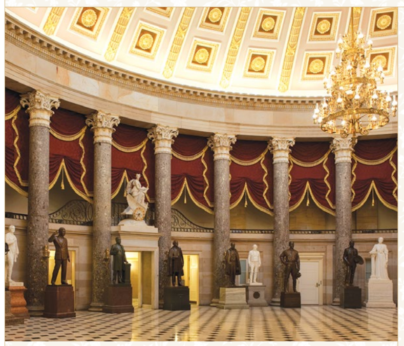
Willa Cather will one day be among the one hundred statues representing fifty states in the National Statuary Hall at the U.S. Capitol in Washington, D.C.

In addition to the symbolic Cather homecoming of properties and collections, it is our great pleasure to share that Willa Cather will be one of two Nebraskans to represent the state in the National Statuary Hall Collection at the U.S. Capitol in Washington, D.C. This not only signifies Cather's importance to Nebraska but her national literary stature.