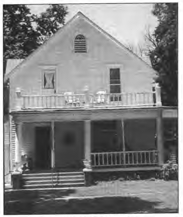
The Cather Second Home Seward Street at Sixth Avenue, Red Cloud.