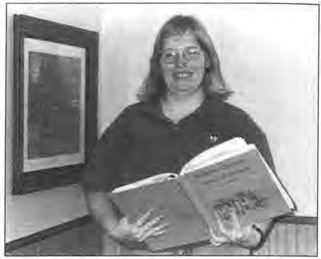
Ann Tschetter

Woodress, James. Willa Cather. A Literary Life. Lincoln and London: U of Nebraska P, 1987.