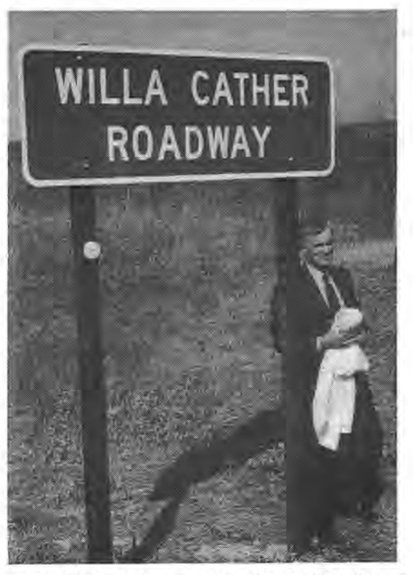
Senator Bob Kerrey unveils sign marking the Willa Cather Roadway May 1, 1999.

The Spring Conference received a mini-grant from the Nebraska Humanities Council to provide partial funding for participating humanists. As a recipient of an NHC grant, Nebraska Public Radio was able to record "The Passing Show" panel discussion and the evening address by Senator Kerrey. Nebraskans, therefore, will be able to hear the panel discussion and Kerrey's remarks at a later date on NPR.