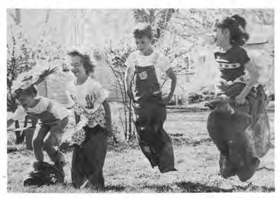
Children from across the region gathered in the yard of the Cather childhood home in April for the WCPM's annual Pastimes and Playthings. With fine weather and several oldtime toys and games to enjoy, a day of fun was, well, in the bag.

For more information, call or write: Nebraska Statewide Arboretum P. O. Box 830715 UNL Lincoln, Nebraska 68585-0715 Phone (402) 472-2971