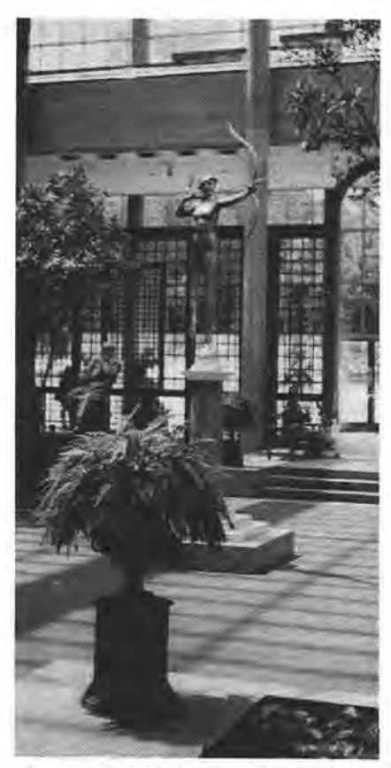
Catherites at the Metropolitan Museum of Art viewed one of Saint-Gaudens's models for the Diana on the old Madison Square Garden.