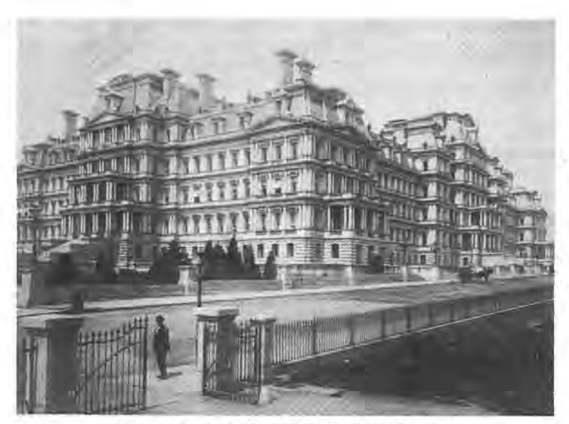
State, War, and Navy Building, 1871-Present.

to Blue Mesa, after almost three months in the nation's capital, eager to "live a free life and breathe free air" (209-13).