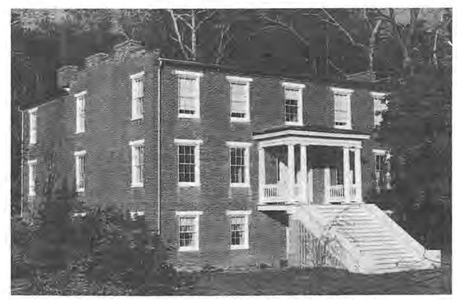
"Willow Shade," Virginia, home of Willa Cather (1874-83).

326 N. Webster Street Red Cloud, Nebraska 68970 Telephone (402) 746-2653