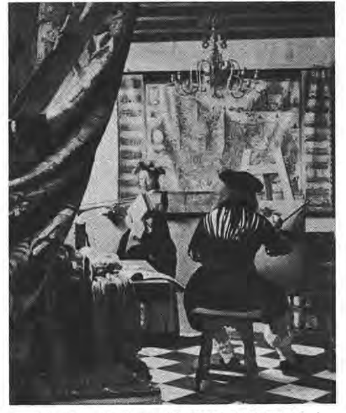
Figure 3 — Jan Vermeer, AN ARTIST IN HIS STUDIO Kunsthistoriches Museum, Vienna

The inhabitants in the forest, the Indians, are feared (523), and even the town surrounding the Auclair home is a place of turmoil and strife, a place "always full of