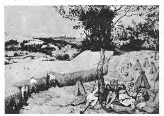
Figure 1 — Pieter Bruegel, THE CORN HARVEST Metropolitan Museum of Art, New York

The haying is described from the wide-eyed perspective of the little Blake girls, who are awakened by the sharpening of the scythes. Perhaps Cather's significant achievement in her Virginia novel is her rendering of place, the setting of her very earliest memories. She describes the assembly of mowers scattering over the long meadow and then swinging their scythes to the accompaniment of a musical ground in the chesty "'huh-huh' they made when they chopped wood" (891). References to the sun suggest increasing heat, which causes the first pause in this rhythmic activity at the iron spring surrounded by spotted orange tiger lilies; here the gourd is passed from one worker to the other. The next pause is for the arrival across the meadow of dinner (even Martin is