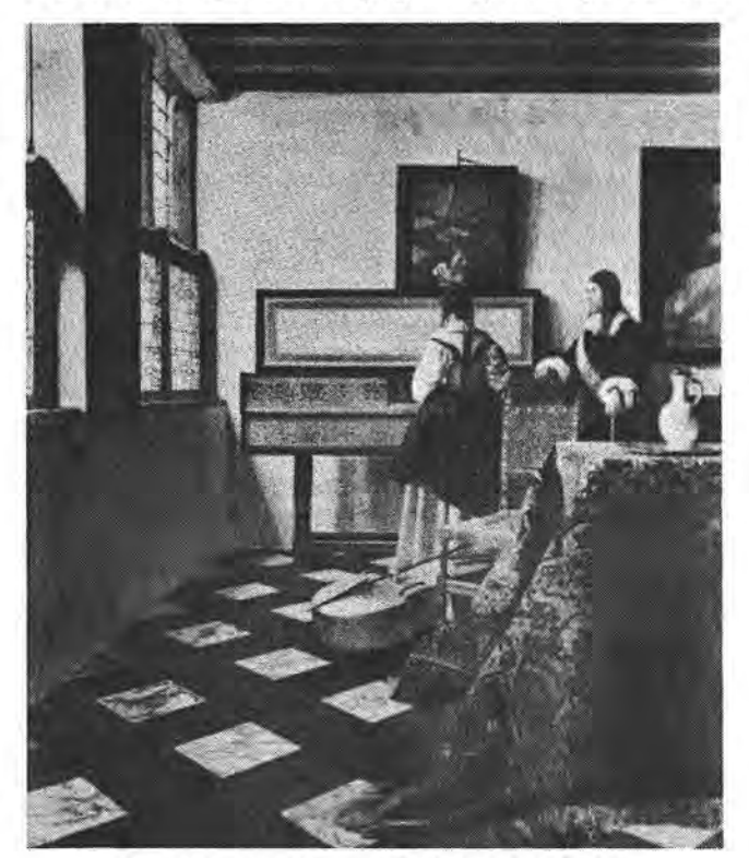
Figure 4 — Jan Vermeer, THE MUSIC LESSON Buckingham Palace, London

The interior of the Auclair home becomes a space which preserves French culture. Just as the Dutch genre painter Vermeer depicts "a domestic world . . . refined to purity" (Gowing 17), Cather depicts the Auclair home as a place of order, serenity, and stability. Wilenski points out that in "pictures by Vermeer, we are always conscious of the front plane indicated by a curtain or some other device" (187). His work entitled An Artist in His Studio (Figure 3) exemplifies this