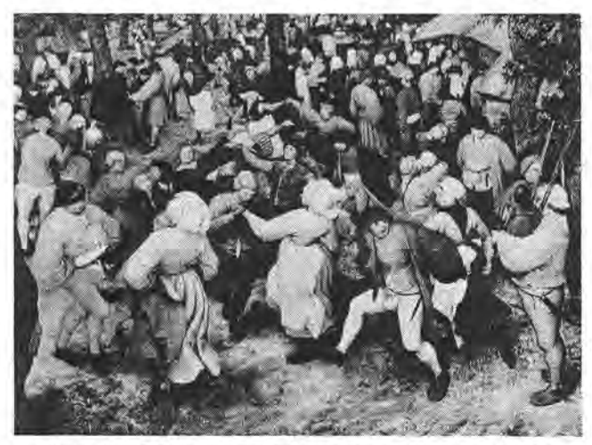
Figure 2 — Pieter Bruegel, THE WEDDING DANCE IN THE OPEN AIR, Institute of Arts, Detroit

Through this story Cather achieves another Bruegelian set-piece, the dancing of the field hands — Bruegel's The Wedding Dance in the Open Air communicates the same joy and, for some contemporary mentalities, condescension (Figure 2). Dave is accomplished on the mouth-organ, which "he used to play for