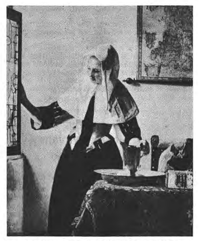
Figure 6 — Jan Vermeer, A YOUNG WOMAN WITH A WATER JUG, Metropolitan Museum, New York

Arnolfini floor is holy ground, while "the fruit on the windowsill refers to the innocence of Adam and Eve before the Fall" (66). Helen Gardner says that the single burning candle in the chandelier denotes "the presence of the omnivoyant eye of God" (706). There are some interesting similarities between this room and the Auclair home. The first object mentioned in this home is a solitary burning candle: "On entering the door the apothecary found the front shop empty, lit by a single candle" (468). Like the Arnolfini room, Auclair has "a four-post bed, with heavy hangings," in the corner of the room (480). Like the Arnolfini home, the Auclair home contains several domestic objects laden with religious symbolism. Cecile's silver cup is decorated with an "engraved . . . wreath of roses," bringing an emblem of Mary into the home. Another prominent decoration is the china shepherd boy, which is "the object of [Jacques's] especial admiration" (519). This statuette's association with Christ the good shepherd is confirmed by Jacques's interest, since Jacques himself is connected with the Holy Child by Bishop Laval (511). These images of Mary and Christ make this home into a sort of chapel, a place where holy tasks are done.