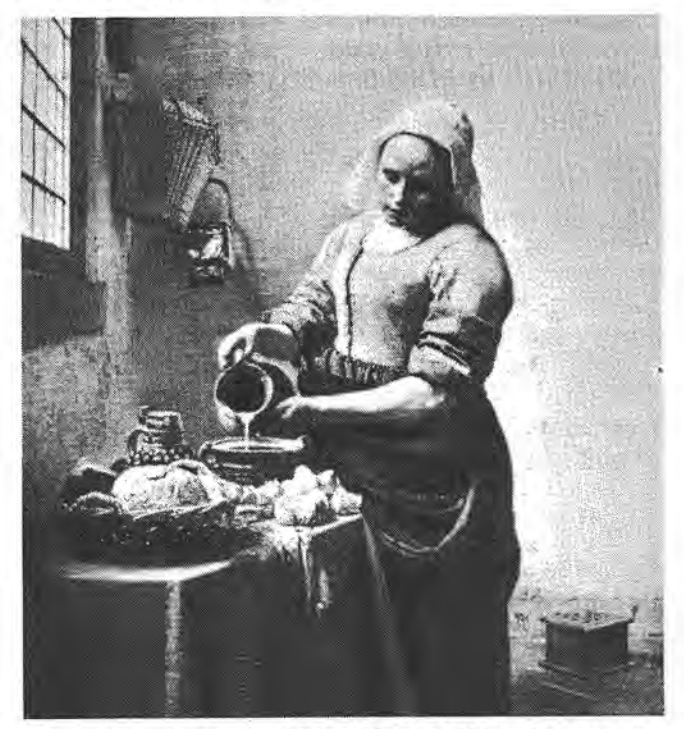
Figure 5 — Jan Vermeer, A MAIDSERVANT POURING MILK Rijksmuseum, Amsterdam

Vermeer's scenes are inevitably illuminated by a soft, non-dramatic light from a window, as in The Music Lesson (Figure 4). There is nothing harsh, violent, or emotional about this lighting; it gives a serene, reflective tone to the subject. Similarly, Cather's domestic setting is illuminated by such soft, even lighting. For example, "the snow, piled up against the windowpanes, made a grey light in the room" (479). Later, when Cecile is sick, she rests and watches "the grey daylight fade away in the salon" (564). Another important aspect of Vermeer's technique is his attention to the texture and color of domestic objects. In paintings like A Maidservant Pouring Milk (Figure 5) and A Young Woman with a Water Jug (Figure 6), meticulous attention to these objects is apparent. Vermeer optically reproduces the texture and color of glass, metal, wood, and cloth. Auclair's house similarly reveals an artist's attention to beloved "things": there is a "walnut dining table," a "cooper-red cotton-velvet" sofa (478), "coppers, big and little" (589), "gilt picture frames," and "brass candlesticks" (564). The domestic area is "made up of wood and cloth and glass and a little silver" (480); these textures are outward symbols of the "individuality" and "character" (480) of the home; they separate it from the rest of the community and the threatening world beyond.