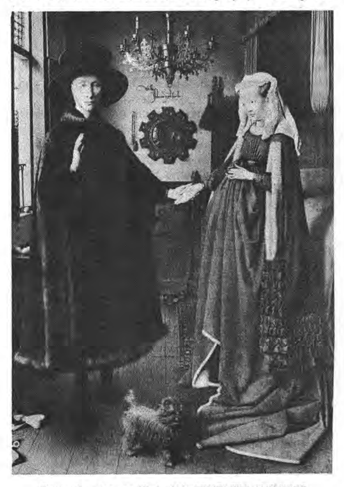
Figure 7 — Jan van Eyck, JAN ARNOLFINI AND WIFE National Gallery, London

More pervasive than these confession acts, however, is the Eucharistic imagery pervading the