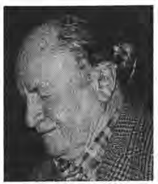
Marshall prepares to read.

During the banquet master of ceremonies Ron Hull proudly announced that "Nebraska is a very singular place." After a full day in Cather country, no one would argue with that. Later that night a wine and cheese party at the Red Cloud Country Club informally concluded the conference. But as always it's hard to return home after an exciting trip. On our way back to Blue Hill, my friends and I stopped once again at Ántonia's farm and the starry peacefulness of a moonless night marked for each of us a memorable end of a truly memorable day.