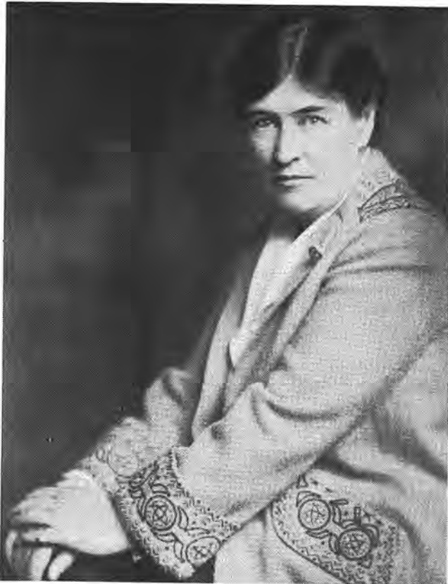
Willa Cather portrait photo, used on the Willa Cather Pioneer Memorial maximum postcard printed specifically for the First Day of Stamp Issue in Red Cloud September 20.