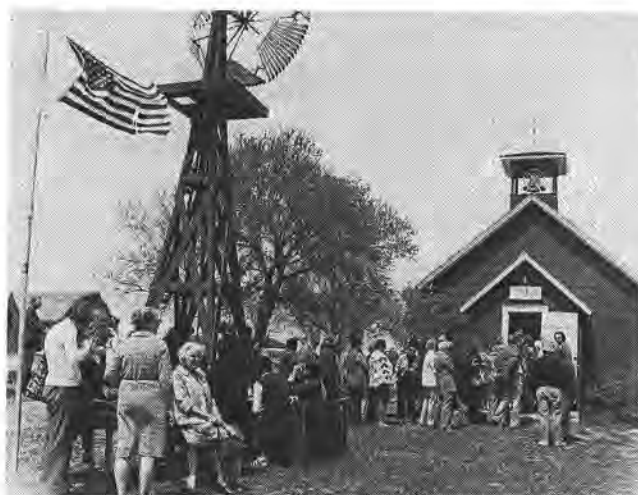
The Little Red School House where busloads of people are stopping for picnic lunch while touring the 50 Catherland points of interest marked by the Memorial.