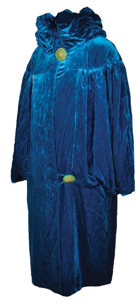
Cather's silk velvet cape from Paris, 1920s

Drawing deeply from the Willa Cather Foundation's archives — with the Foundation's own items forming the core of the wide-ranging display — the exhibit tells "the story of a woman