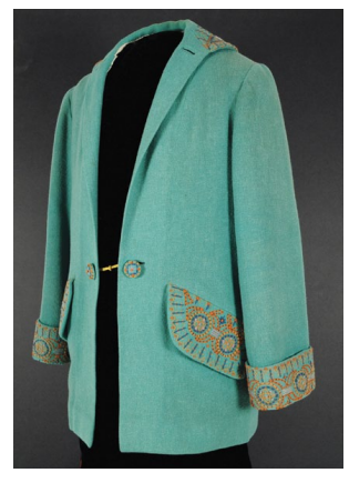
The famous teal jacket

"Willa Cather: A Matter of Appearances" opened in October 2010 and runs through August 2011, after which many of its treasures will be on display in the Red Cloud Opera House Gallery.