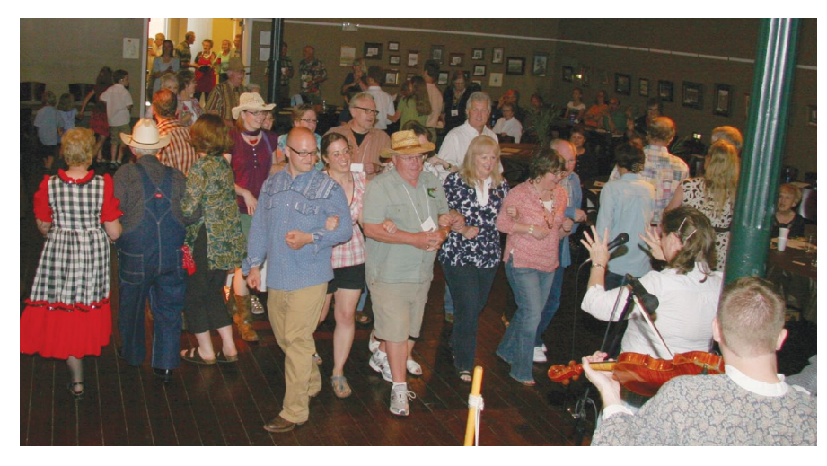
"Barn dance" revelers at the Red Cloud Opera House

of Willa Cather's youth — to name just two of the conference's high points — there were also chances to taste the delicious foods under discussion (all of them included in our new cookbook). Conference goers were truly able to fill, and refill, their plates.