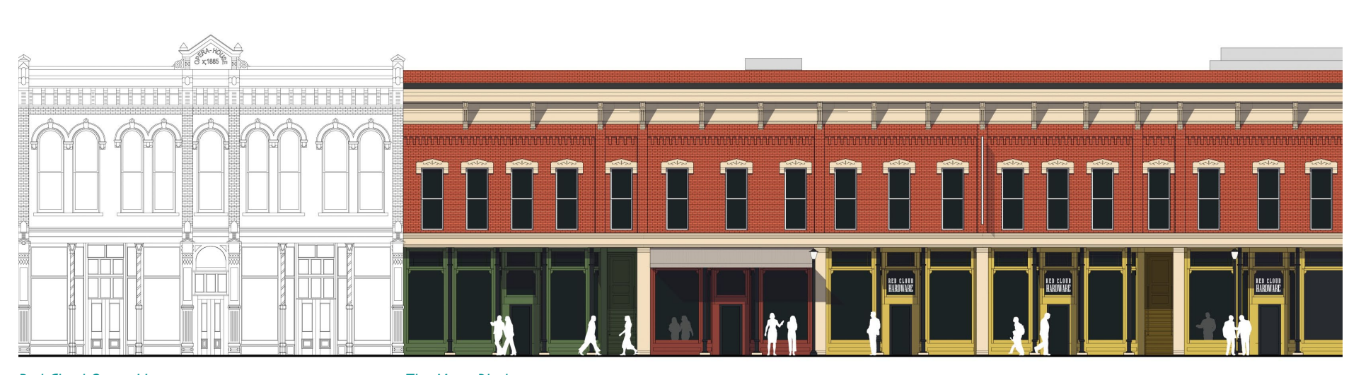
Red Cloud Opera House