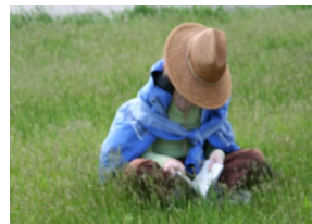
A participant makes use of the Prairie for inspiration during the 2010 Prairie Writer's Workshop

Please join us and let your inner writer out!