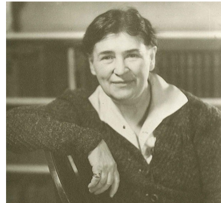
Willa Cather on her 63 rd birthday, December 7, 1936

Willa Cather (1873-1947) was a Pulitzer Prize-winning American author who first achieved national recognition for novels such as O Pioneers! and My Ántonia , in which she drew on her own experiences of growing up on the frontier prairies of Nebraska. But Cather was born in Virginia, lived for several years in Pittsburgh, spent her last forty years as a resident of New York City, and traveled widely throughout the United States and in Canada and Europe. The imaginative "Catherland" of her fiction draws on the full range of these settings and