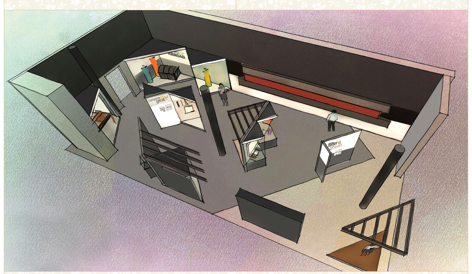
A preliminary sketch of the exhibit's layout.

The Institute of Museum and Library Services is the primary source of federal support for the nation's 123,000 libraries and 35,000 museums. Their mission is to inspire libraries and museums to advance innovation, lifelong learning, and cultural and civic engagement. Their grant making, policy development, and research help libraries and museums deliver valuable services that make it possible for communities and individuals to thrive. To learn more, visit www.imls.gov.