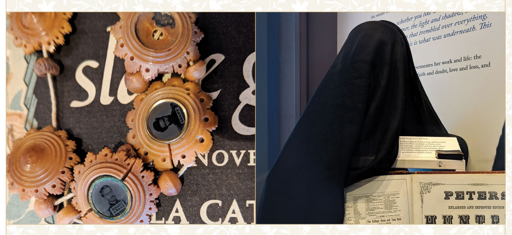
A display of Civil War items and mourning accoutrements that the Cather family brought to Nebraska.

As we prepared for the International Willa Cather Seminar in Virginia, we were interested in showing ways that the Cathers' lives in Virginia continued to influence their lives in Nebraska. Located as they were near Winchester, Virginia, we anticipated that the Seminar would explore issues related to the tensions of the Civil War era, and so from the WCPM collection at the National Willa Cather Center, we selected this carved tagua nut Civil War commemorative bracelet, with ferrotypes of Ulysses S. Grant and William S. Rosenkrans (misspelled on this bracelet). Other examples of this type of piece also include a ferrotype of William Tecumseh Sherman, which may be the missing image in this bracelet.