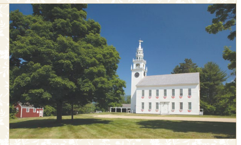
The Meeting House in Jaffrey, New Hampshire.

Registration for the weekend will sell out and is strictly limited to 140 participants! For more details, see the event schedule on our website. Online registration is available at www.jaffreychamber.com.