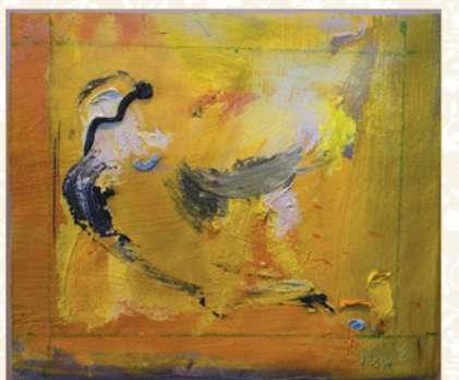
Jim Condron "The blond cornfields were red gold, the haystacks turned rosy and threw long shadows"