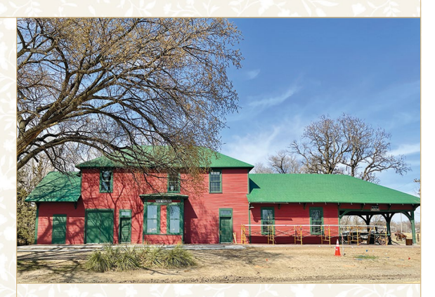
The restored facade of the Burlington Depot.

The Burlington Depot has undergone significant improvements. Windows and doors have been restored, and siding that matches the original historic profile has been installed. Relocation of new mechanical equipment will allow for additional exhibit space. Original bricks from the station platform have been reinstalled. The original two-story section of the depot, constructed in 1897, is the building Cather was familiar with during her last years in Red Cloud.