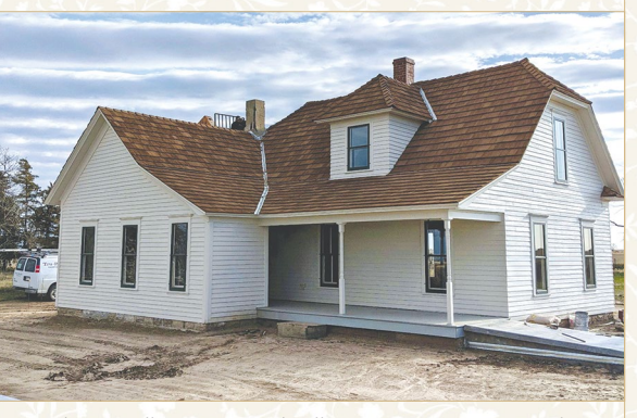
The Pavelka Farmstead following exterior restoration efforts.

The Pavelka Farmstead has been restored to its period of significance. The home's foundation has been stabilized, lighting and mechanical systems have been added to accommodate future interpretation, and a walking path and access ramp have been established to make the site accessible for all of our guests. The farmstead was home to Anna Sadilek Pavelka, prototype for Cather's Ántonia. Restoration will make it available for guided tours for the very first time.