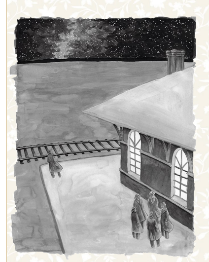
A new illustration for the short story "The Sculptor's Funeral."

You can order Youth and the Bright Medusa from our website, and a complete set of eight limited edition 8x10 giclee prints from Blitch's illustrations are also available.