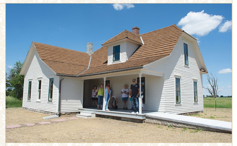
This year, many attended our full day in Red Cloud of site open houses and a prairie tour on the last day of our second hybrid conference.

The last day of the conference coincided with National Prairie Day. The occasion was celebrated with a guided morning