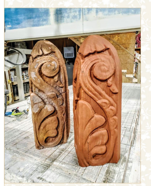
The sandstone tourelle on the right was fabricated as an exact replica of the original shown on the left.

W. S. Garber. The building, later referred to as "one of the finest and most complete banking buildings in the state," was