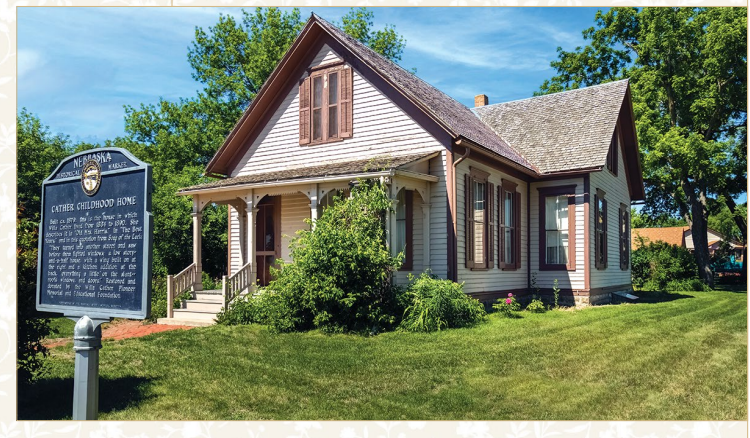
The Willa Cather Childhood Home is undergoing its first major restoration in over fifty years.

The restoration is a key component of the National Willa Cather Center's Campaign for the Future, which has raised over $7 million for restoration of numerous Cather-related historic properties, expansion of educational