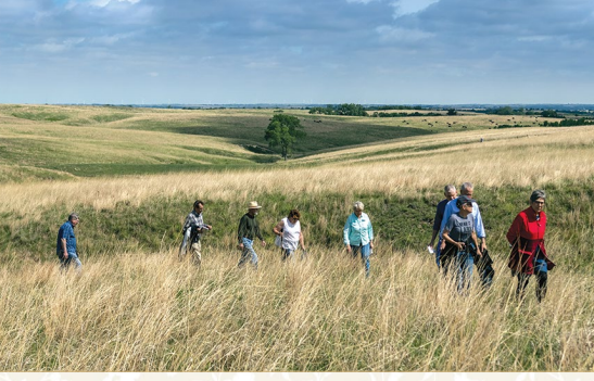
Visitors participate in a guided hike at the Willa Cather Memorial Prairie on National Prairie Day.