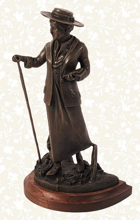
A bronze Willa Cather sculpture is a perfect gift for any Cather enthusiast or a fine addition to your own home library.

The Willa Cather Foundation has been named the exclusive retailer for the small-scale sculptures by the Willa Cather National Statuary Hall Committee. Proceeds of all sales will