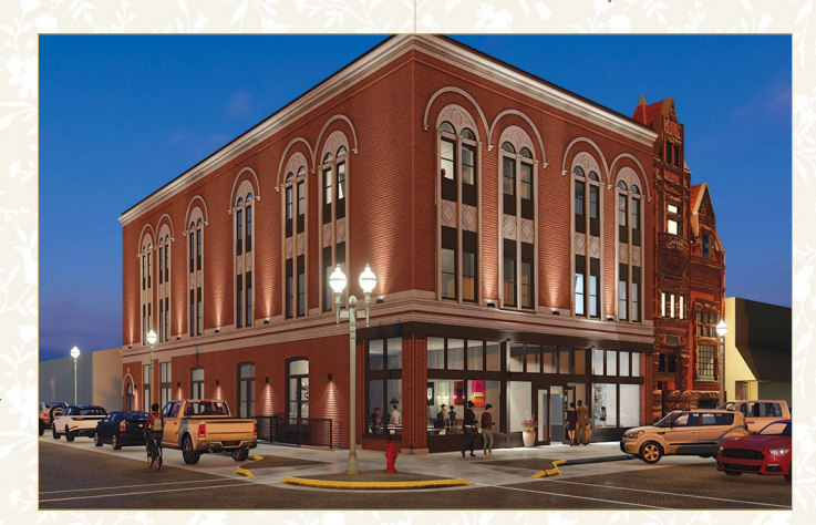
The Hotel Garber will provide 26 rooms, and its design will echo the historic Potter Block

Please consider supporting the project with a charitable gift. Naming and recognition opportunities are available, and pledges are payable over a 5-year period. Contributions may be mailed to the Willa Cather Foundation, 413 N. Webster St., Red Cloud, NE, 68970 or made online at www.willacather.org