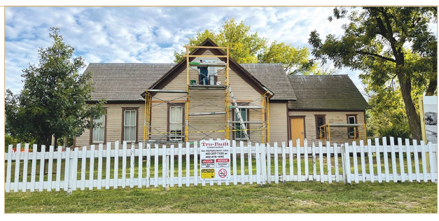
Exterior restoration in progress.

the room's original wallpaper. The attic has been insulated; its knee walls and ceilings have been enclosed with tongue-and-groove siding that matches both the profile of existing materials and the nailing pattern of materials that are missing from the attic. A climate control system has been installed to aid with conservation of the wallpaper and the well-being of visitors and staff, as the attic