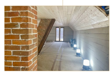
The ceiling in the attic has been partially enclosed according to historic nailing patterns.