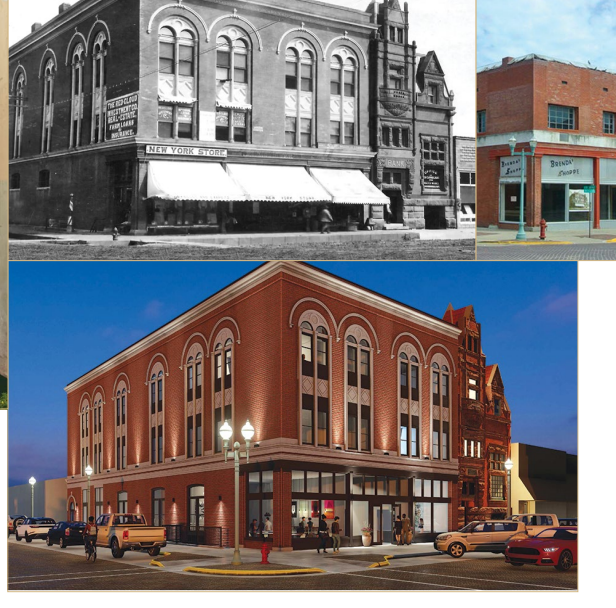
Building imagery: The Potter Building in the early 1900s, today, and as designed for rehabilitation.