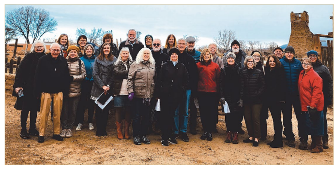
Attendees at our first Taos gathering, pictured here at Taos Pueblo.

To register, visit www.WillaCather.org/Events.